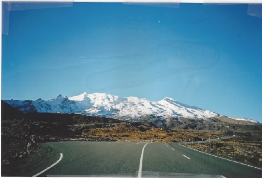
Mount Ruapehu, New Zealand