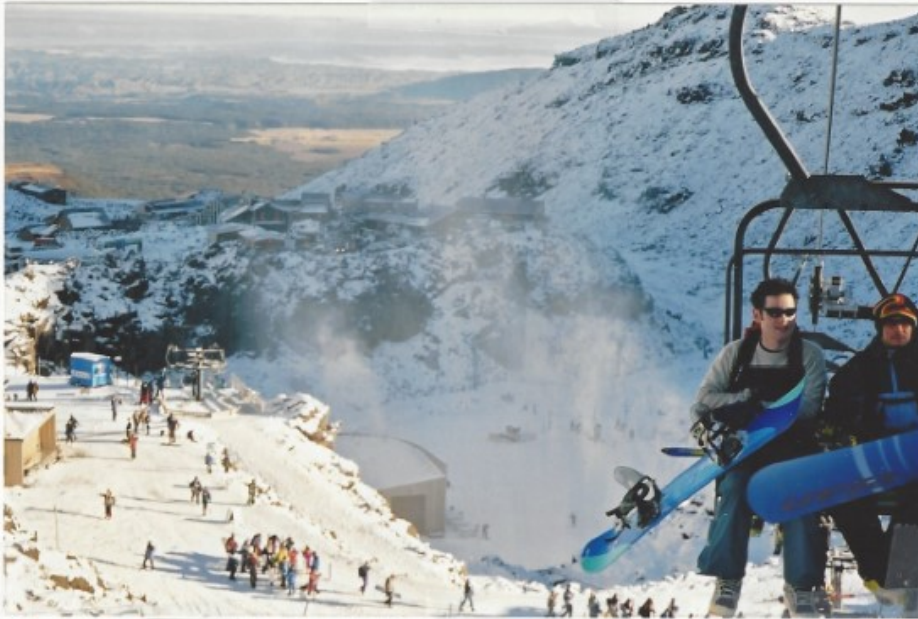
'Whakapapa Ski Resort', Mount Ruapehu, New Zealand